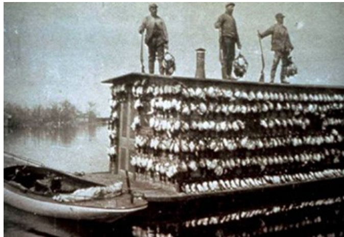
market hunters in Wisconsin ca. 1910.

Additional international agreements include the Ramsar Convention of 1971 which maintains a list of wetlands of international importance and works to encourage the wise use of all wetlands (especially for marshbirds and shorebirds) from which wetland values derive. The Antarctic Treaty (1961) set protections for the native birds, mammals, and plants of internationally-managed Antarctica.