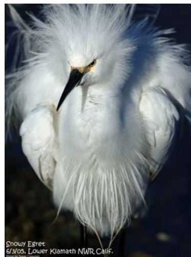
Snowy Egret 6/3/05, Lower Klamath NWR, Calif.

(1913) Weeks-McLean Act outlawed transportation of plumage in an effort to slow the commercial use of wild birds. Then in 1916, the Migratory Bird Treaty definitively protected these birds and their eggs. With these protections, and the establishment of wildlife refuges and other protected areas, its numbers rebounded. However, wetland loss, environmental contaminants, and competition from other species are now causing declines in regions of the northeastern United States, the Midwest, and California.