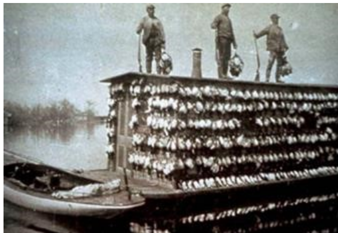
market hunters in Wisconsin ca. 1910.

Additional international agreements include the Ramsar Convention of 1971 which maintains a list of wetlands of international importance and works to encourage the wise use of all wetlands (especially for marshbirds and shorebirds) from which wetland values derive. The Antarctic Treaty (1961) set protections for the native birds, mammals, and plants of internationally-managed Antarctica.