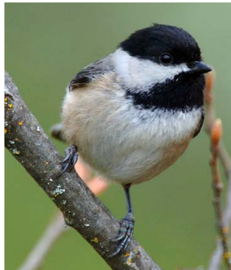
Black-capped Chickadee

The two banding stations are both located along the banks of Bear Creek. This Black-capped Chickadee had dispersed approximately 15 miles downstream following a riparian corridor through three southern Oregon towns where the Bear Creek Greenway protects riparian habitats. This small bird's recapture is just one demonstration from KBO's banding data of the importance of conservation of riparian habitats and wildlife corridors.