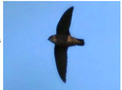
Vaux's Swift