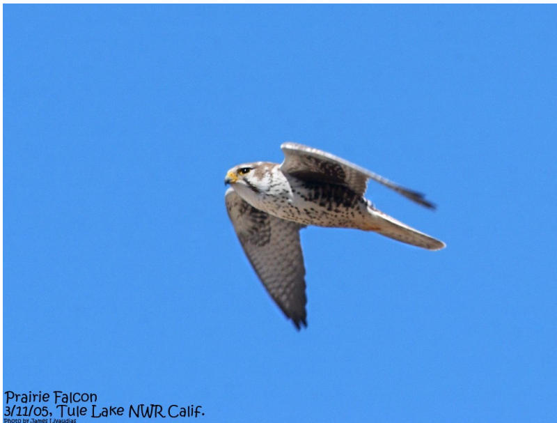
Prairie Falcon 3/11/05, Tule Lake NWR, Calif.