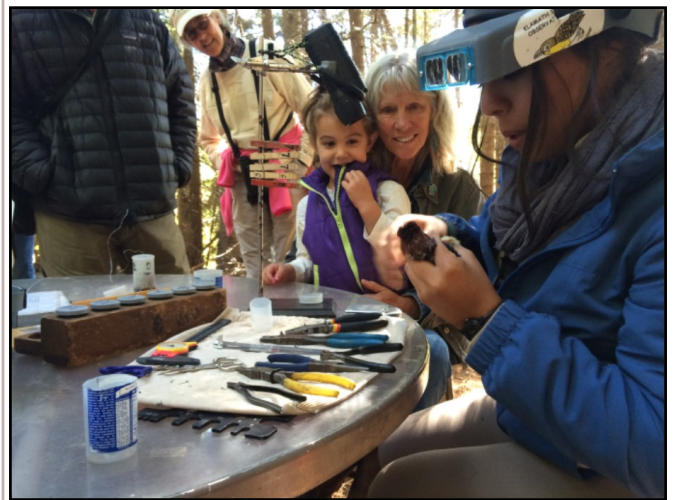
Banding station visitors enjoy a close-up look at a bird being measured before it is released

Visiting a bird banding station is a memorable and educational experience that provides incredible views of birds and a deeper understanding of how bird conservation science improves our stewardship of nature. We invite groups and individuals to contact us about scheduling a visit to a banding station and associated fees.