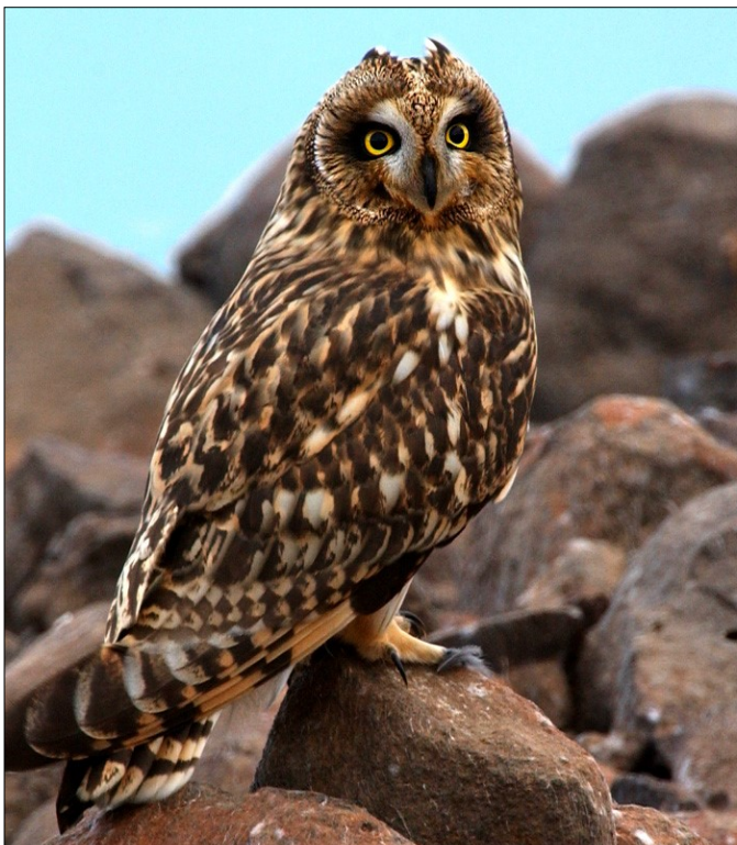
Short-eared Owl

This quiet hunter of open areas is seen more frequently in the day-lit hours than other owls. The No-eared Owl might be more befitting (see below) as the short “ears” are really short! More conspicuous are its black-framed yellow eyes set in a pale and usually buffy facial disk. It is a medium-sized owl with a rounded head, breast with bold brown streaks and pale or buffy belly. In flight the pale underwing has a dark comma-shaped mark near the wrist, and the upper-wing shows a pale patch. As with other owls, the female averages larger, as well as darker and buffier than the male.