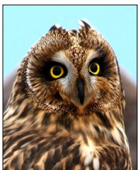
Short-eared Owl

The Western Asio Flammeus Landscape Study (aka WAFLS) is a citizen science project designed to engage the public in a large-scale Short-eared Owl population assessment. Results from this project will directly inform high-value conservation actions by state and federal agencies. Volunteers receive training and experience in critical observation, the scientific method, and data collection. They will collect data about this enigmatic, open-country species using a standardized survey protocol.