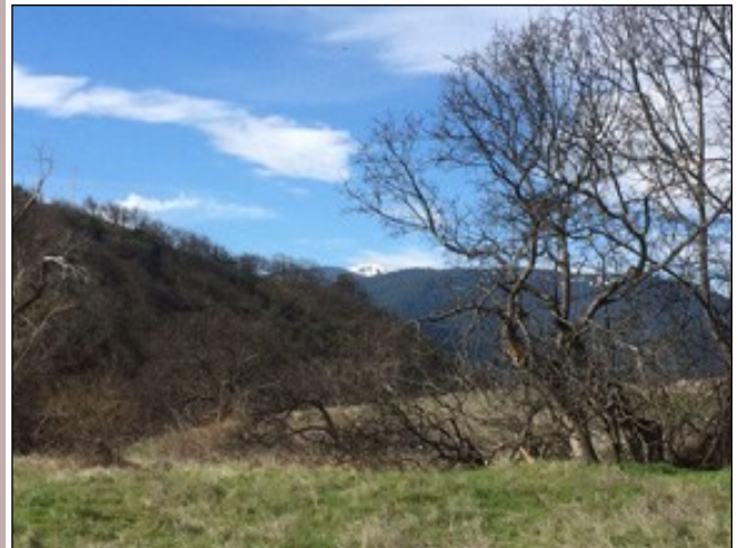
Sampson Creek Preserve in winter

The Sampson Creek Preserve Project is a citizen science-driven effort created by KBO and the Selberg Institute. Its objective is to inventory and monitor birds that are using the variety of habitats within the Sampson Creek Preserve throughout the year. Nestled in the rising Cascades foothills northeast of Ashland, the Preserve includes meadows, oak woodlands, conifer forests, and riparian woodlands—and home to a diversity of bird denizens. The project's citizen ornithologists receive training in how to collect data and use eBird, and help complete monthly surveys.