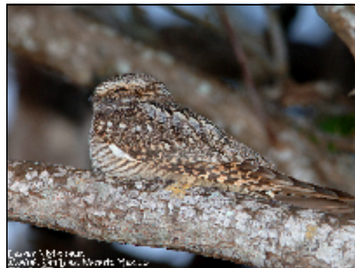
The nocturnal Lesser Nightjar relies on crypsis to help avoid predators while sleeping on tree limbs during the day.

Aposematism is the method of being obvious as a warning to predators, often coupled with being poisonous. For example, this may occur in poisonous frogs or insects.