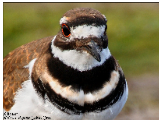
The Killdeer's alternating black and white bands are an example of disruptive coloring, helping to break up the outline of the bird and make it more difficult to see against a background.